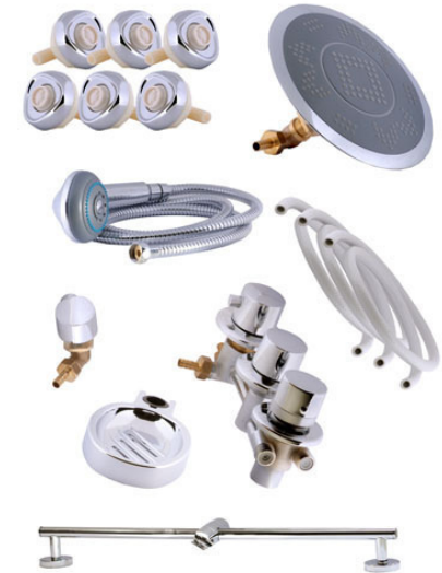
Optional Shower Kit